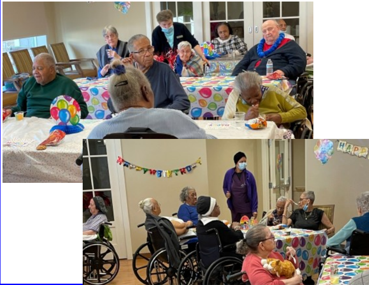
Pictures from the Birthday Celebration with the residents of Sacred Heart Nursing Home.