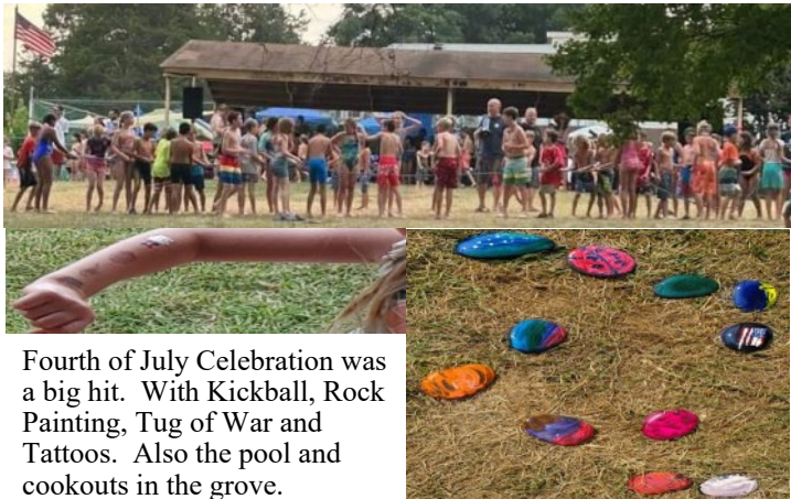
Fourth of July Celebration was a big hit. With Kickball, Rock Painting, Tug of War and Tattoos. Also the pool and cookouts in the grove.